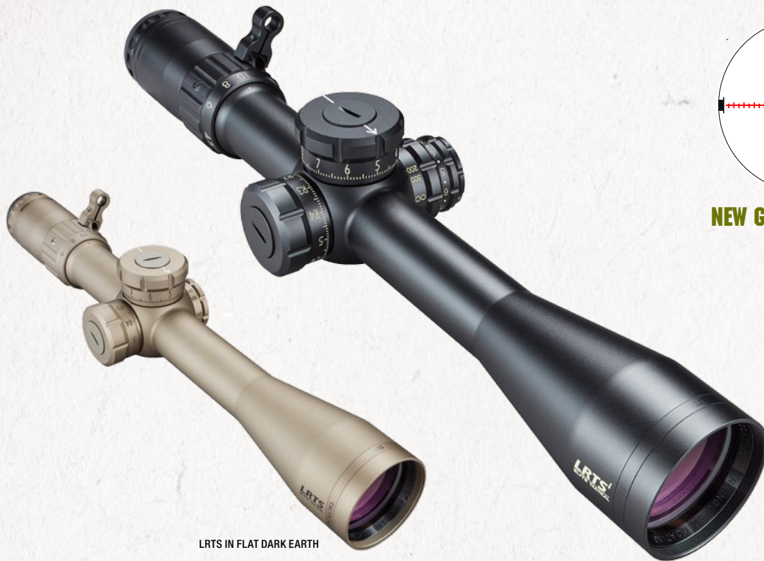
LRTS IN FLAT DARK EARTH